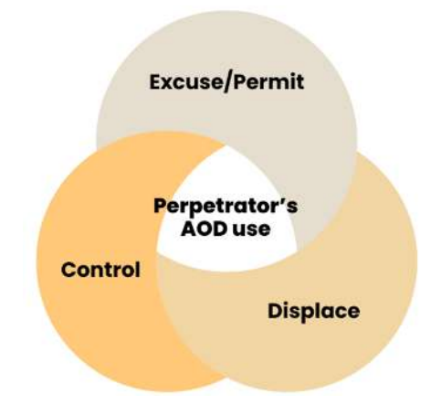
Figure 1. How perpetrators' behaviours intersect with their own substance use <sup>5</sup>.