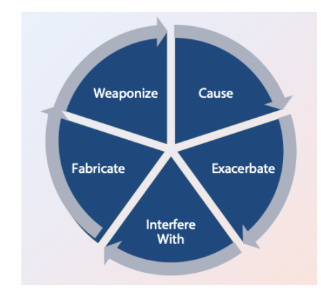
Figure 2. How perpetrators' behaviours intersect with survivors' substance use.