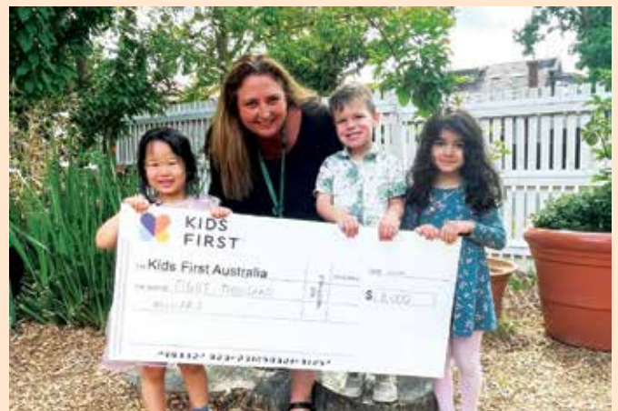
A representative from Kids First poses with some little helpers from MLC Kindle.

We are so grateful to the MLC Kindle community for selecting us as the recipient of this $8000 donation, which we used to purchase items for our children's Sensory Room at our Heidelberg Child and Family Centre. This amount was raised from MLC Kindle's art exhibition and auction.