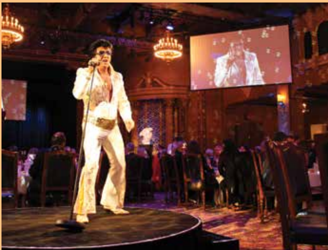
Guests enjoyed a hip-swinging live performance at the 2022 3AW Lunchtime Rumours Feast.

In addition to partnering with us for the Lunchtime Rumours Feast, 3AW selected us as their feature charity for April, with daily recorded and live messages on radio and posts across their social media exposing us to more than 700,000 weekly listeners in Victoria alone. This visibility was amplified through 3AW's affiliate station 2GB in Sydney, which contributed significantly to our 2023 Tax Appeal results.