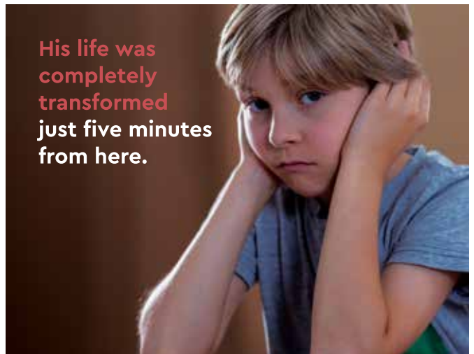
An image from the 2023 Kids First Tax Appeal campaign.