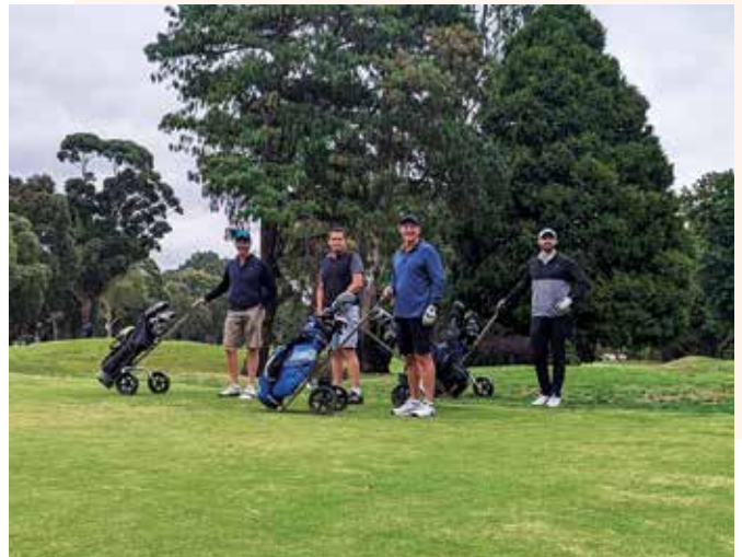
Attendees pose for a photo at the 2023 Kieser Golf Day for Kids First.

Held at the Latrobe Golf Course in Alphington, 124 players took to the turf and for the 9 th year in a row, Kieser selected Kids First as their chosen golf day charity. Sponsorship, players' fee contributions, and funds raised from raffles and a live digital auction led to this fun-filled day of competition and camaraderie raising a record $57,000. We thank Kieser for their continued support.